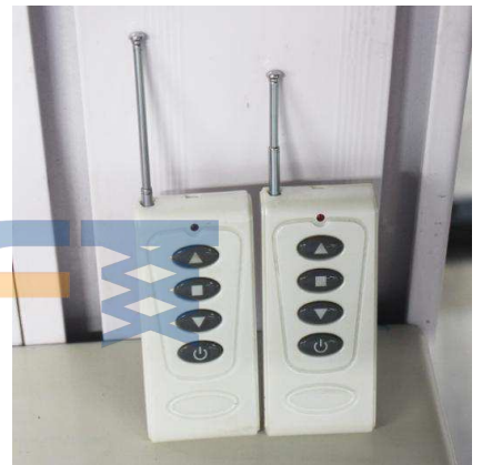
Remote control ( optional )